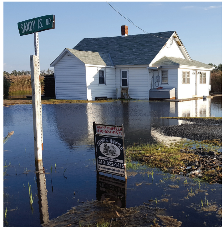
Effective management our coastal resources requires improvements in understanding vulnerability and risk.

To help build coastal resilience, UMCES scientists will assess the relative merits of built (gray) infrastructure and natural (green) infrastructure. A holistic approach to understanding how marshes, wetlands, living shorelines, aquatic grasses, and beach vegetation can help stabilize coasts will be employed. We will also develop scientific expertise and partnerships to span and integrate natural sciences, engineering, urban planning, and social sciences needed for innovative solutions. UMCES will also build on its record of translating scientific discoveries and innovations into effective management actions.