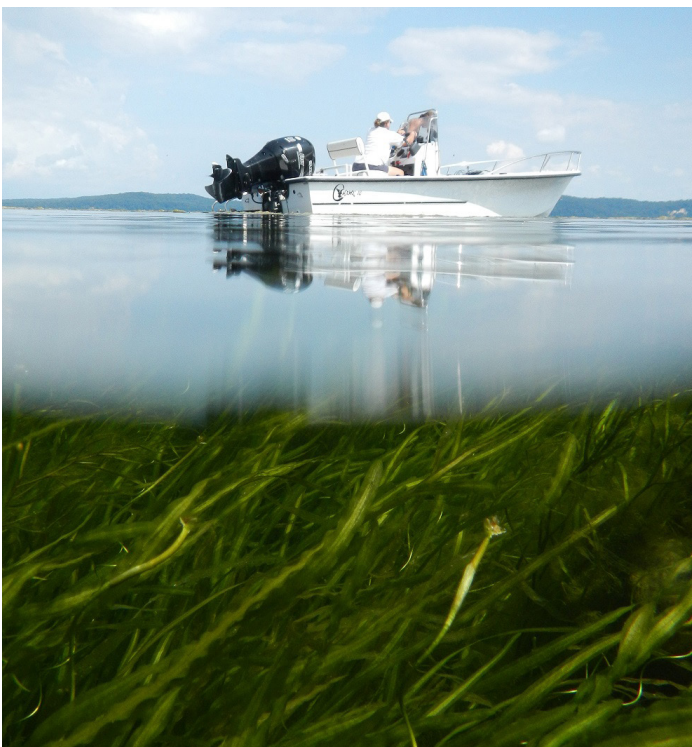
UMCES scientists support large-scale restoration efforts for Chesapeake Bay health.

Addressing these strategic initiatives demands we change the way we conduct science and education. First, we envision forming strategic partnerships with academic partners, agencies, NGOs, and private industries to achieve this vision. Second, we need to develop a more diverse and inclusive workplace so that our faculty, students, and staff better reflect society. Third, we aim to become a leader in environmental sustainability by exporting our expertise, experience, and educational programs around the nation and across the globe.