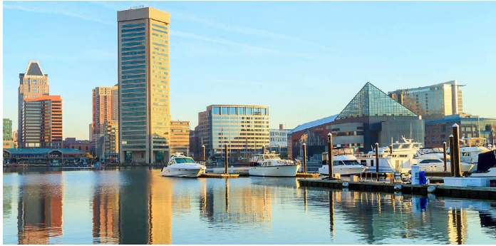
Urban waterfronts like Baltimore's Inner Harbor are particularly vulnerable to intensified coastal development and to storms and flooding.

Urban waterfronts, including harbors and ports, are a defining feature of coastal cities and serve as gateways