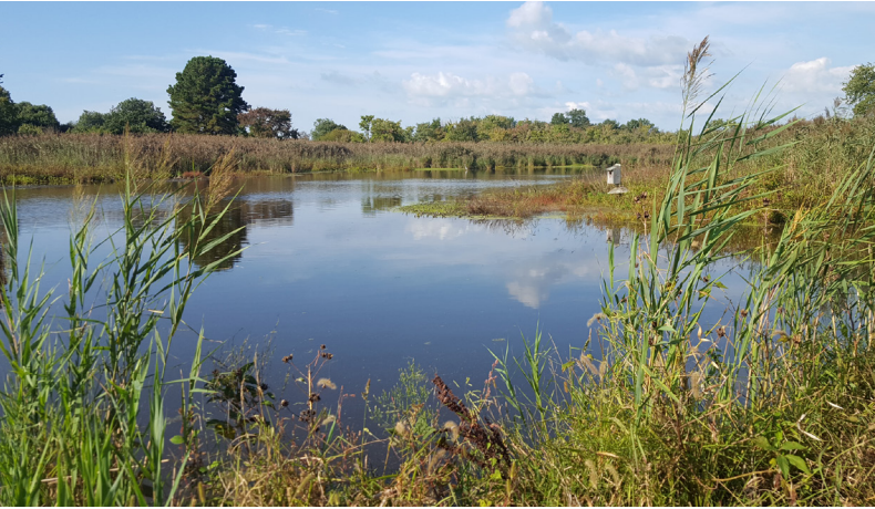
To help maintain and promote sustainable landscapes and seascapes, we aim to enhance our understanding of the structure, function, and dynamics of these ecosystems.

UMCES has developed internationally recognized expertise in terrestrial and aquatic ecology, fish and wildlife management, agriculture, and environmental economies. Building from our Chesapeake Bay focus,